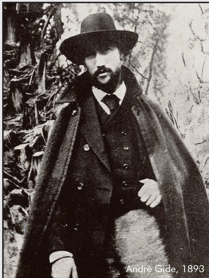
André Gide, 1893